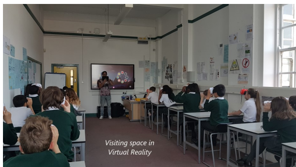
Visiting space in Virtual Reality